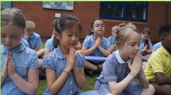
Photo of worship leaders with icon poster